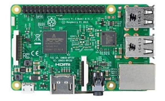
Raspberry Pi B+, 2 B, 3 B, 3 B+