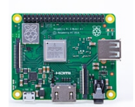
Raspberry Pi A+, 3 A+