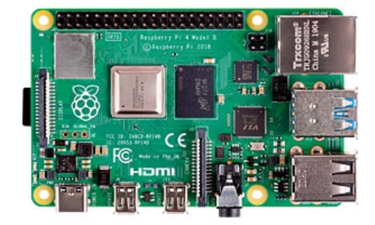
Raspberry Pi 4 B